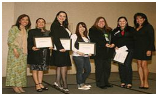
Student Scholarship Awardees