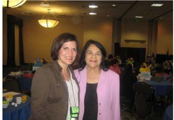
LLN honoree Dolores Huerta sharing her sentiments... "believe in yourselves but also focus on the need for service to others."